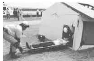
Rescue and Aid Drilling